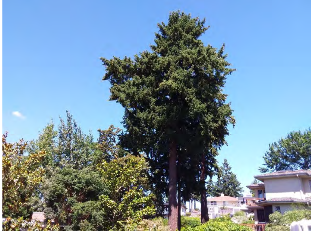
Figure 5. Looking NNW at the #4 fir and showing its conformation.