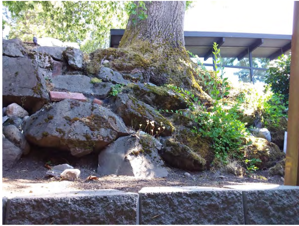
Figure 7. Looking up and east at the base of the #5 oak. The concrete blocks at the bottom of the photo are the top or the Keystone wall shown in Figure 8.