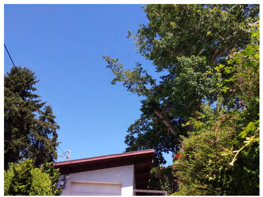
Figure 6. Looking up and north at the west side of the #5 oak's canopy. It was pruned back as to not extend over the roofline of the existing house. This was likely done in anticipation of selling the home.