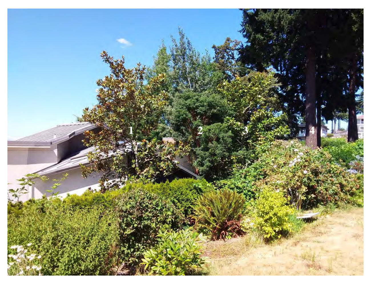
Figure 4. Looking NW at the #1-4 trees.