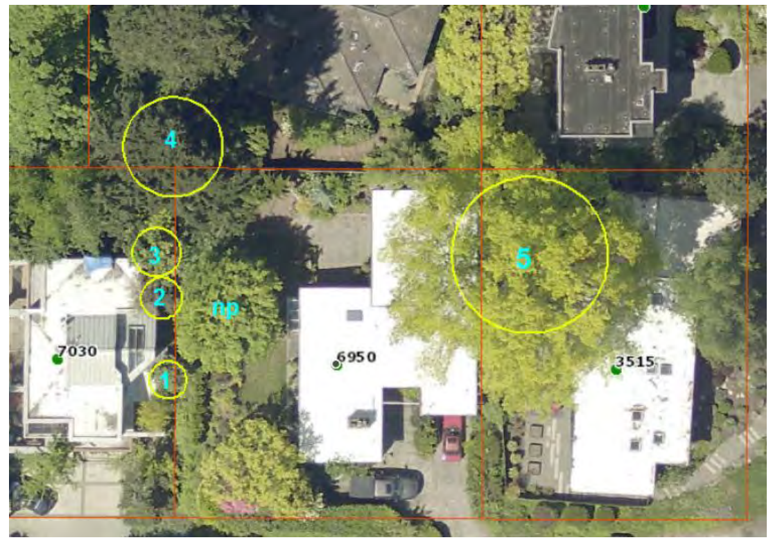
Figure 3. Aerial photo circa 2019 showing the approximate locations of the trees noted in the study (teal numerals). The yellow circles just help spot the numbers. The 'np' stands for 'not present' as this plant was not present at the time of the August 2022 site visit. It is presumed to have been removed by the previous owners in anticipation of selling the home.