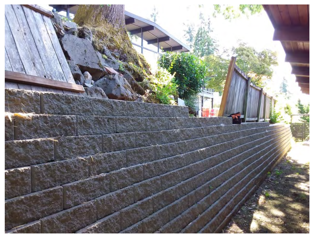
Figure 8. Looking SSE down the length of the Keystone block retaining wall running along the east side of the existing house. Note the base of the #5 oak at top center of the photo, The edge of the existing roof is visible in the top right corner of the image.